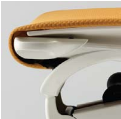
Rolling front edge adjusts seat depth.