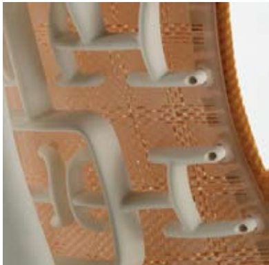
Embody's back conforms to your unique spinal curve.