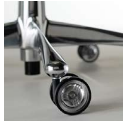
Translucent casters add elegance.