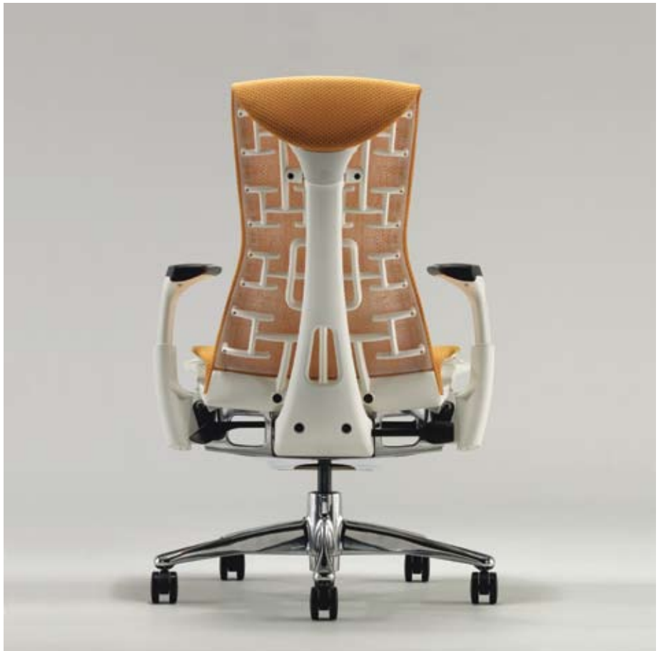
Embody's back looks like your back - it's designed to move like you move.