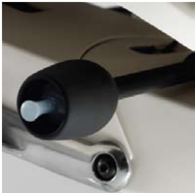
Use the 360° joystick to adjust seat height.