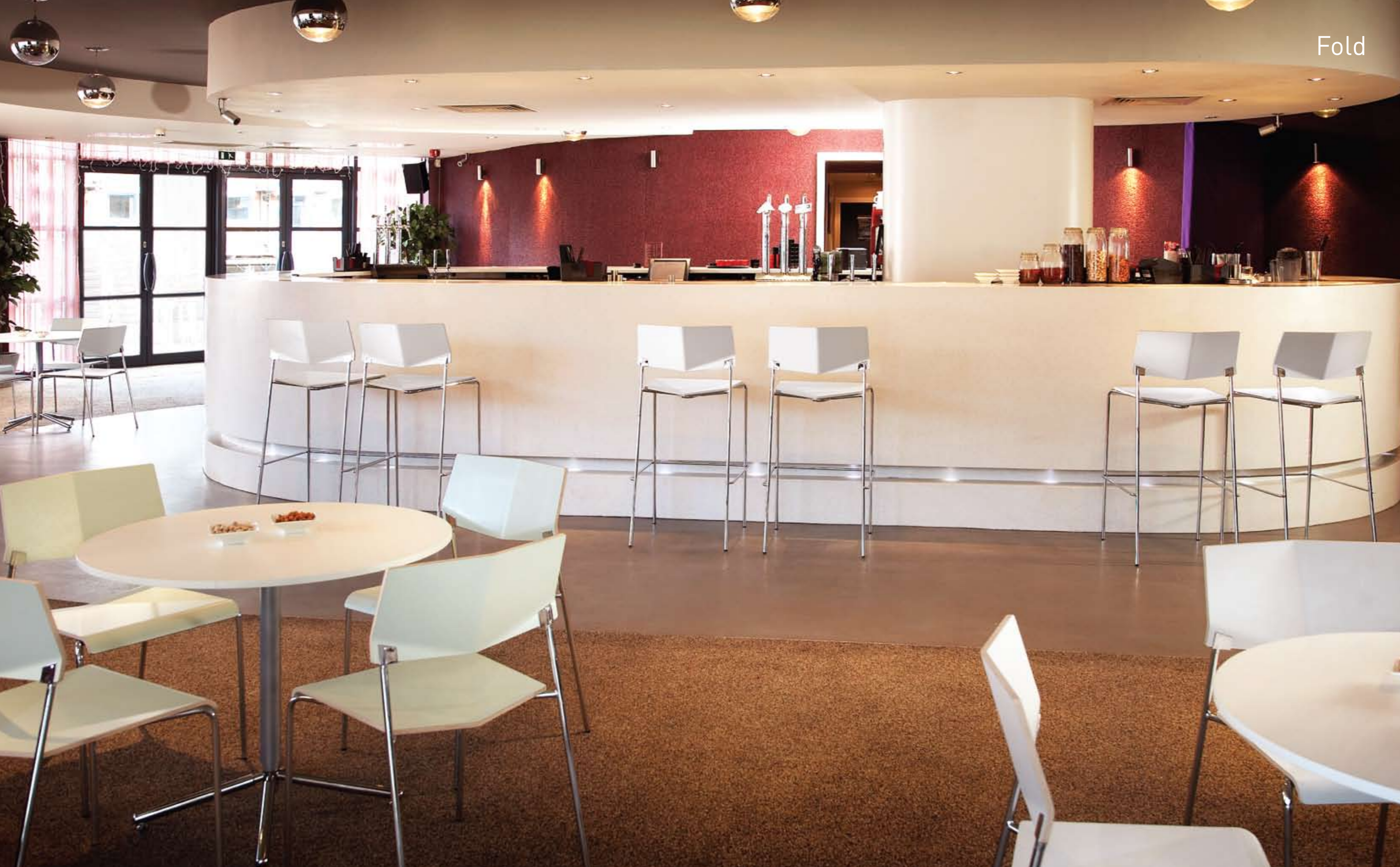
Multi purpose stacking chairs and stools using tubular steel frames, available in wood and colour finishes.